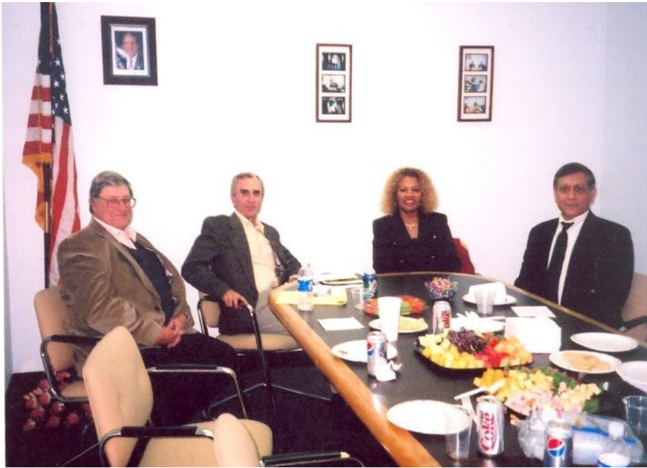
Colorado International University